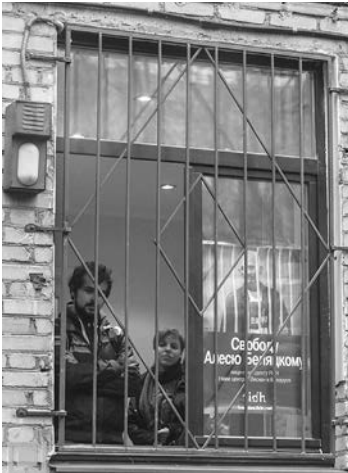
Confiscation of the office of the Human Rights Center «Viasna. Minsk, Nezalezhnasts Avenue, 78A-48, 26 November 2012.