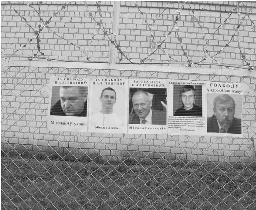
Solidarity with political prisoners. Babruisk.