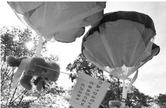
A group of Swedish citizens has conducted a risky and brave action in support of the Belarusian freedom fighters. 3 July 2012.