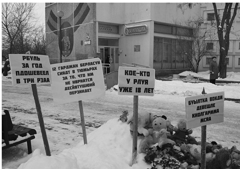
Toy protests — a wide-spread form of protest actions during the year. The photographed action was organized by the youth wing of the civil campaign «Tell the Truth» — «Zmena» on the Universal Day of Human Rights in front of the National Library. Minsk, 10 December 2012.