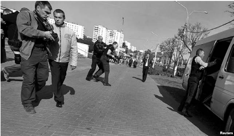
Detention of journalists while performing their professional duties. Action of the youth organization «Zmena» near «Frunzenski» department store in Minsk. 18 September 2012.