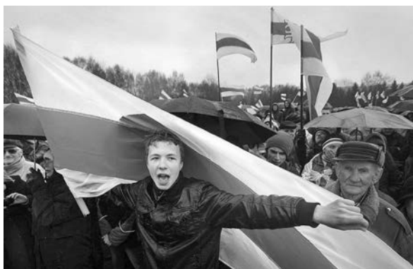
Freedom Day in Minsk on the 94th anniversary of the proclamation of the Belarusian People's Republic. 25 March 2012.