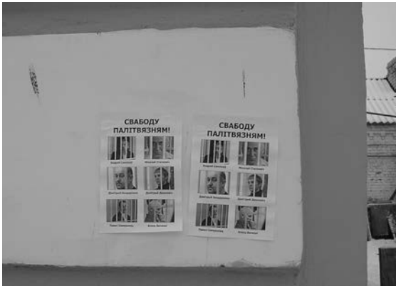
Solidarity with political prisoners in Orsha, Slonim and Polatsk. 2012.