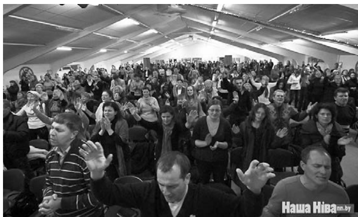
Parishioners of «New Life» holding everyday prayers for saving their temple. Minsk, 29 November 2012.