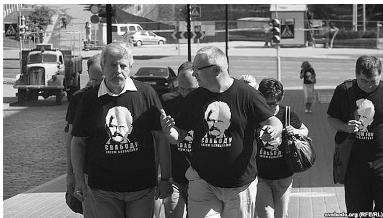
Human rights defenders heading for the Presidential Administration to pass a petition demanding to release Ales Bialiatiski and all political prisoners. Minsk, 3 August 2012.