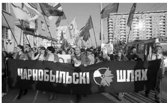
Chernobyl Way 2012. Minsk, 26 April 2012.