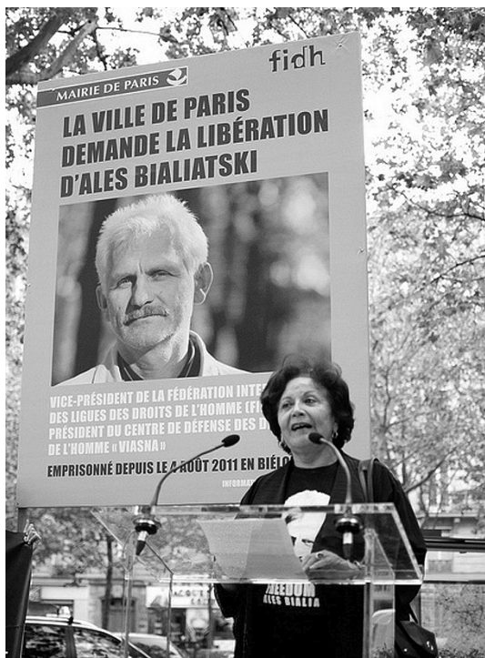
FIDH President Souhayr Belhassen during the installation of a portrait of the imprisoned human rights defender Ales Bialiatiski in front of the Mayor's Office of the 11th arrondissement of Paris. 11 May 2012.