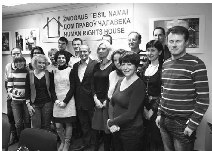
Meeting of Belarusian human rights defenders with the UN Special Rapporteur on Belarus Miklosz Haraszti. Vilnius, 12-13 November 2012.