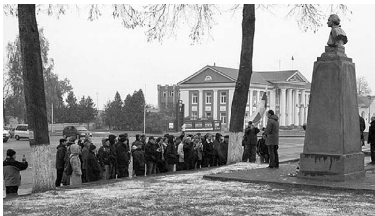
Annual event in the memory of the insurgents of 1863 in Svislach. 27 October 2012.