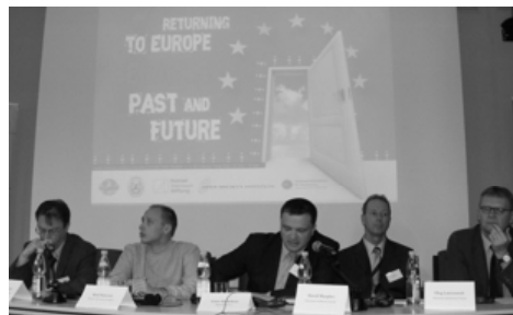
Participants of the Warsaw conference