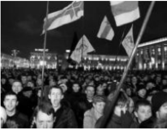
Massive post-election protest