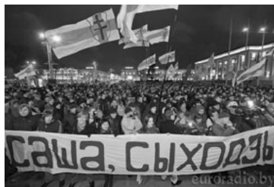
SASHA (nickname for Alyaksandr), LEAVE!