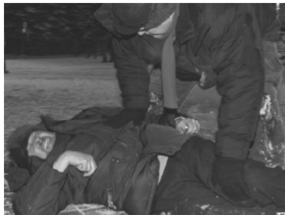
Opposition candidate Andrey Sannikau lies on a street after being beaten by police.

Jerzy Buzek, the president of the European Parliament, demanded that Lukashenka punish those responsible, saying it "casts a shadow over the presidential election."