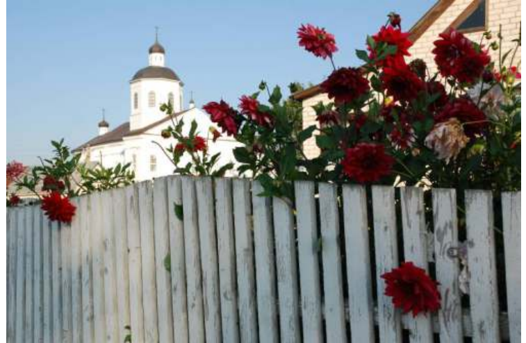
One of the Rakaw's main streets

During the Sangushkas' rule Rakaw turned into a prosperous trade centre. It was privileged to hold two bazaars a year, which ensured the constant