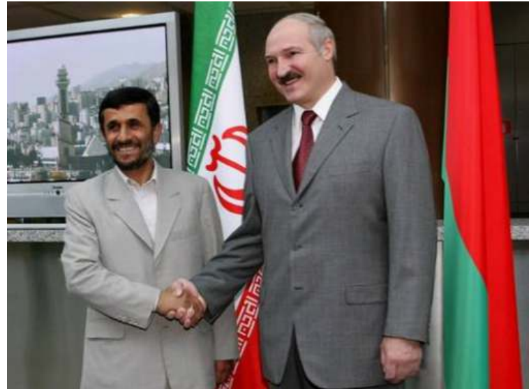
Mahmoud Ahmadinejad in Minsk (2007).

The Iranian regime also used new contacts with Belarus in its propaganda – as a demonstration of a "breakthrough to a new European market." Iranian pro-government media devoted significant attention to projects, visits and exhibitions in Minsk. The negative aspects were omitted – even the opposition Iranian media this February failed to notice the statement by the Belarusian Deputy Prime