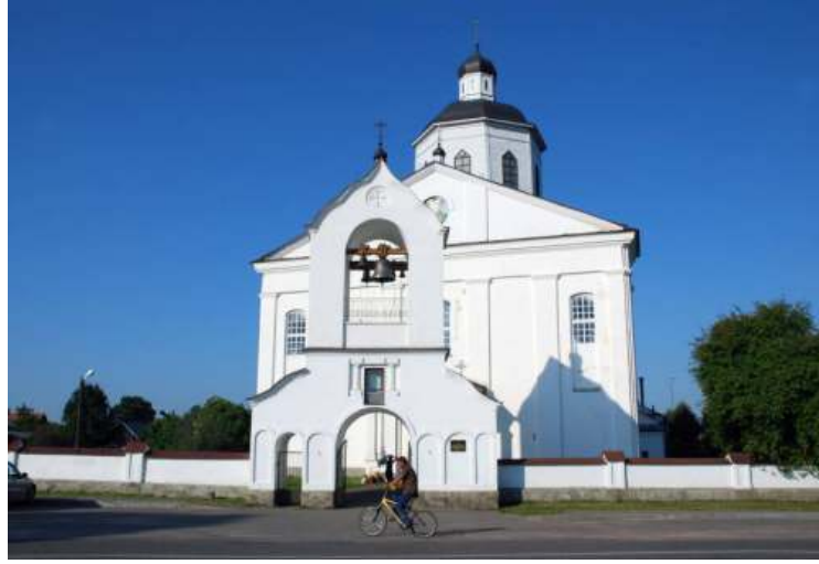
The Church of the Transfiguration was built between 1730-1793 as a union church. It now belongs to the Orthodox Church.

The Second World War ruined his literary plans and gave his life a new turn. By the end of the war, he fled to Italy, and later England leaving his beautiful wife and son behind. After that there are few recorded facts left about his life. There are rumors that he could have been recruited by MI6, or became a prototype for the James Bond series. But I guess, we'll never know for sure.