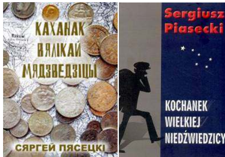
Cover of the book by Sergiusz Piasecki in Belarusian and Polish

Mr Yanushkevich glances pensively through the window onto the empty market place. I look in the same direction and just for a second the village street gives way to a bustling bazaar with merry merchants and traders, mademoiselles looking for new wardrobes, and mysterious clandestine-looking gentlemen hurrying through the happy crowds. It lasts just a second, and then the vision is over, dissolved by the pale rays of the winter sun.