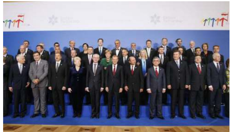
Leaders of European countries pose for a family photo during the Eastern Partnership Summit at the Prime Ministers Chancellery in Warsaw September 30, 2011.

However, no proposals of this kind were made at the summit. The participants welcomed the establishment of the Eastern Partnership Business Forum and the launch of the Comprehensive Institution Building programmes, which are designed to support the implementation of the future European Union Association Agreements. Also, an agreement was reached on the speedy implementation of five pilot initiatives, announced earlier during the initial phase of the EaP creation. The delegates welcomed the inauguration of the Conference of the Regional and Local Authorities for the Eastern Partnership (CORLEAP)