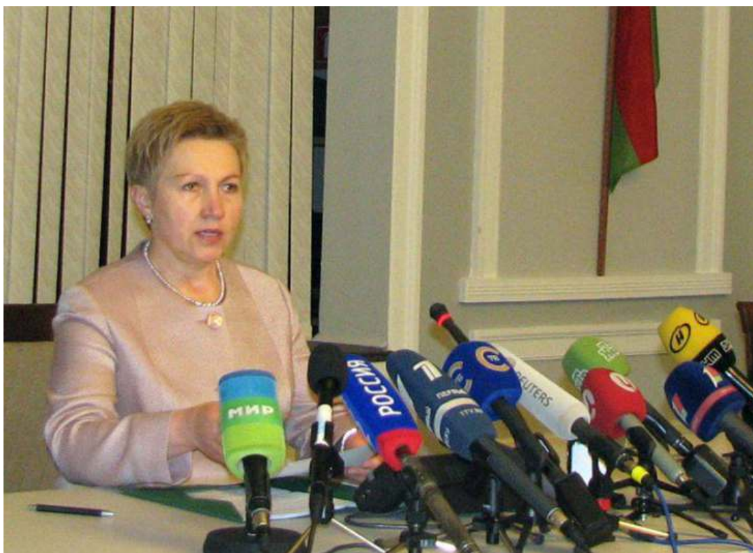
Belarus Central Bank Chief Nadzeya Ermakova at the press-conference where she announced the Devaluation of the national currency. 20 October 2011, Minsk.