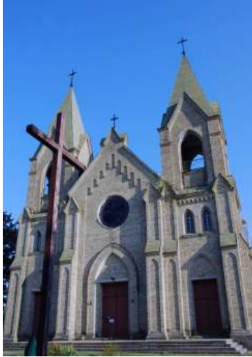
Cathedral of St. Mary